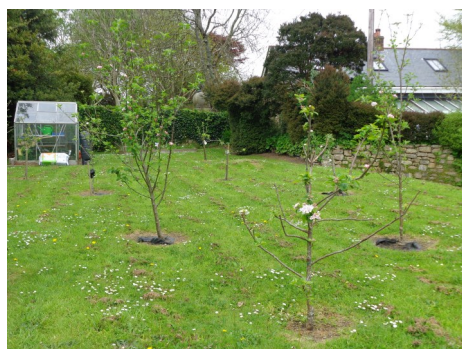
The school wildlife beginning to come into bloom.

Please do go and support this event if you can.