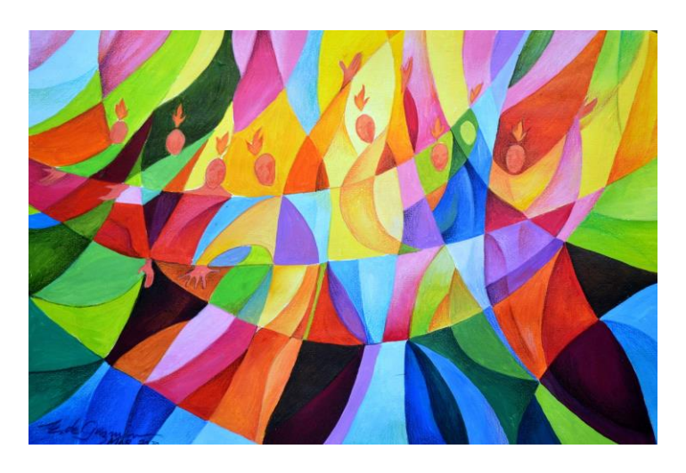
What is Pentecost? Let's just go back......